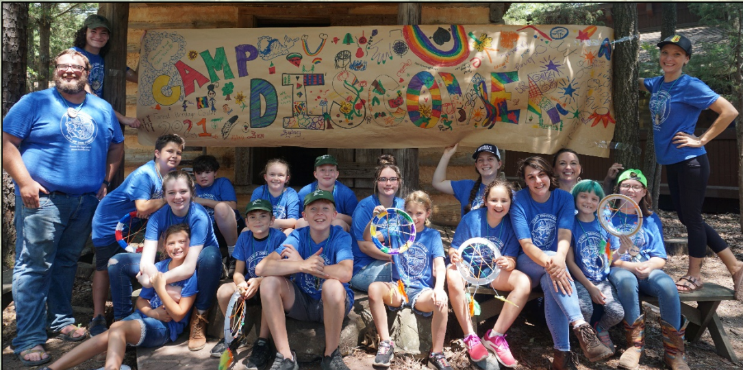
Camp Discover 2021

Using a crosscut saw with Oklahoma Forestry Services firefighters is a camp tradition.