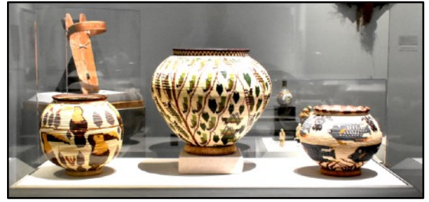
Museum of the Red River exhibit