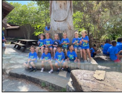
Wright City Pre-K