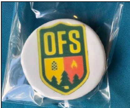
Amy's Macrons and Bakery