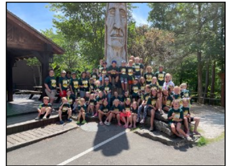
Smithville Students with Pine Seedlings