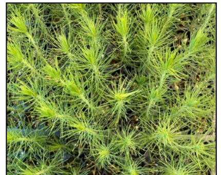
OSU Extension Office Seedlings