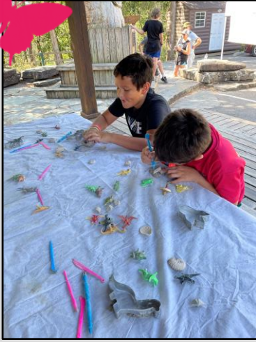
These young men are making fossil impressions using air dry clay, courtesy of Educator Leah Green from the MORR.