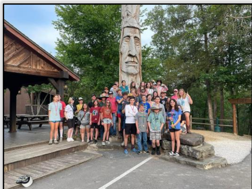
Forestry Camp Students preparing to tour the FHC