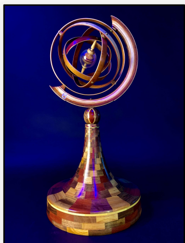
No. 6 Jupiter, aka Lathe Breaker

This year's winner is the 3 rd of four armillary spheres in a series entitled " The Great Conjunction " (2022) inspired from when the artist viewed the planetary conjunctions of Venus, Saturn, Jupiter, and Mars during the Spring of 2022. They are the artist's renditions of Ptolemaic geocentric model Armillary Spheres, whereby the core represents these planets as if they were at the center of the universe. This armillary sphere is intended to be viewed under both normal and UV light. The base is a turned segmented vessel consisting of more than 400 individually glued wood segments. The underside is adorned in pearl inlay.